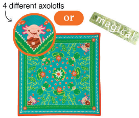
Bandana -OR- hair clip