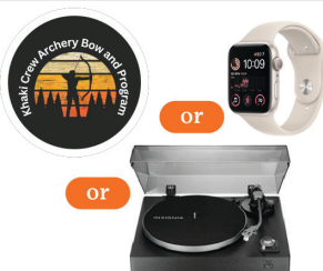
Archery bow and class -OR- Bluetooth stereo turntable -OR- smartwatch (available for Apple or Android)