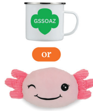
GSSOAZ tin cup -OR- axolotl pillow