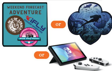
Sedona high adventure -OR- Nintendo Switch OLED -OR- Khaki Crew Scuba Camp