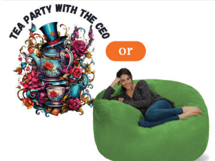
Chill sack -OR- tea party with the CEO