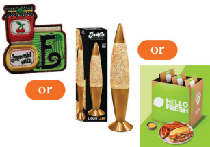
Jammin' with E class -OR- lava lamp -OR- meal kit experience