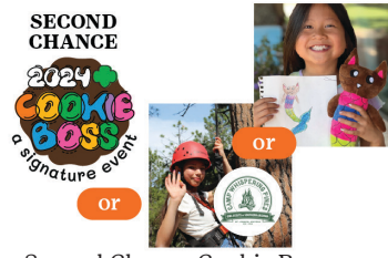
Second Chance Cookie Boss event -OR- week at overnight camp -OR- create your own stuffed friend