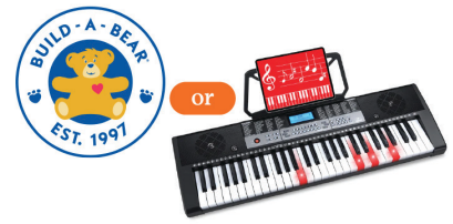
Build-a-Bear Workshop -OR- keyboard piano