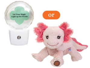
GSSOAZ tin cup -OR- axolotl pillow