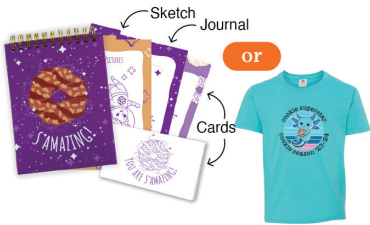
3-part journal sketch pad -OR- fun cookie themed shirt