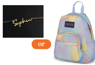
Custom name necklace -OR- mini backpack