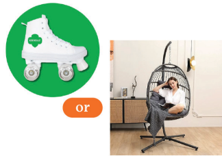
GSSOAZ custom skates and safety gear -OR- hammock chair