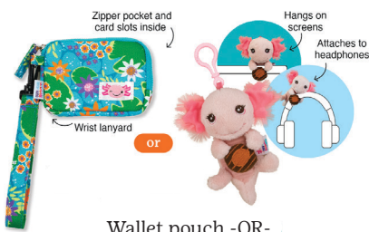
Wallet pouch -OR- small plush