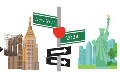
Khaki Crew New York travel experience

REACH 6,000, OPT OUT OF 901-5,999 FOR NEW YORK