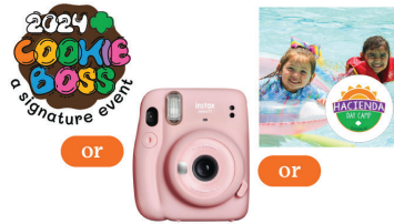
Cookie Boss -OR- Fujifilm instant camera -OR- week at Hacienda Day Camp